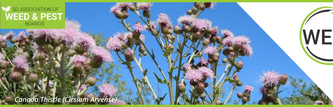
Canada Thistle (Cirsium Arvense)