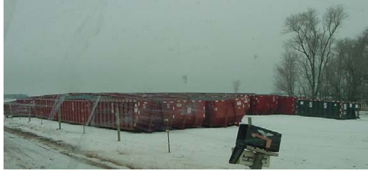
This property owner's daughter worked for Novak Sanitary Service. She volunteered her father's front yard as a storage area for unused dumpsters.